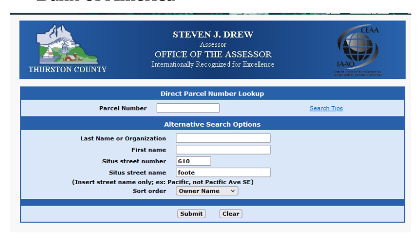
Illustration 1: Assessor Parcel Search

You can look up individual properties or search by property owner, for example if you were trying to find every property in Thurston County owned by Bank of America